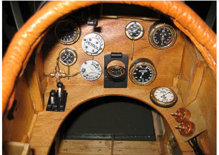
SE-5A panel, hit the switches, contact and go.....